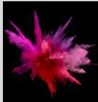
“HIGH-PERFORMANCE” PIGMENT BASE

ULTRA-SHINY COLORING, EXCEPTIONALLY INTENSE COLOR